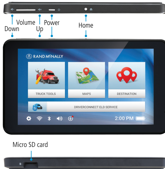
TND™ 740 Quick Start Guide