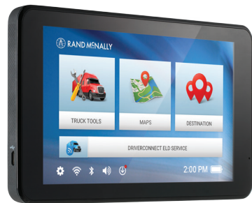
TND™ 740 Quick Start Guide